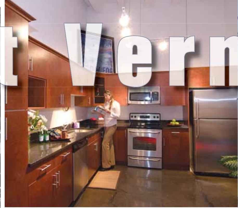
MV24 Lofts on Mount Vernon Street has 48 residential units.