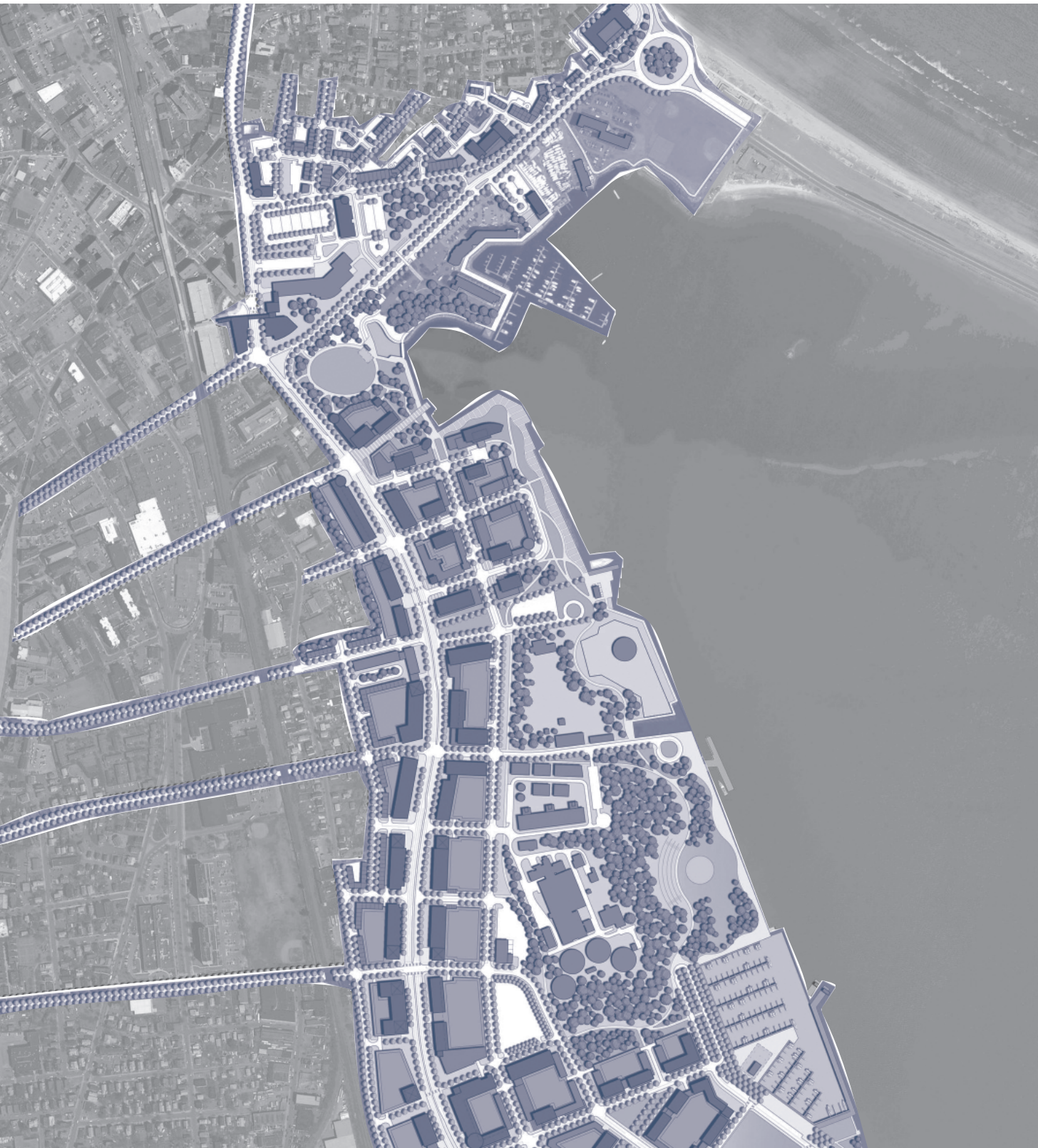
RENDERING OF WATERFRONT PLAN