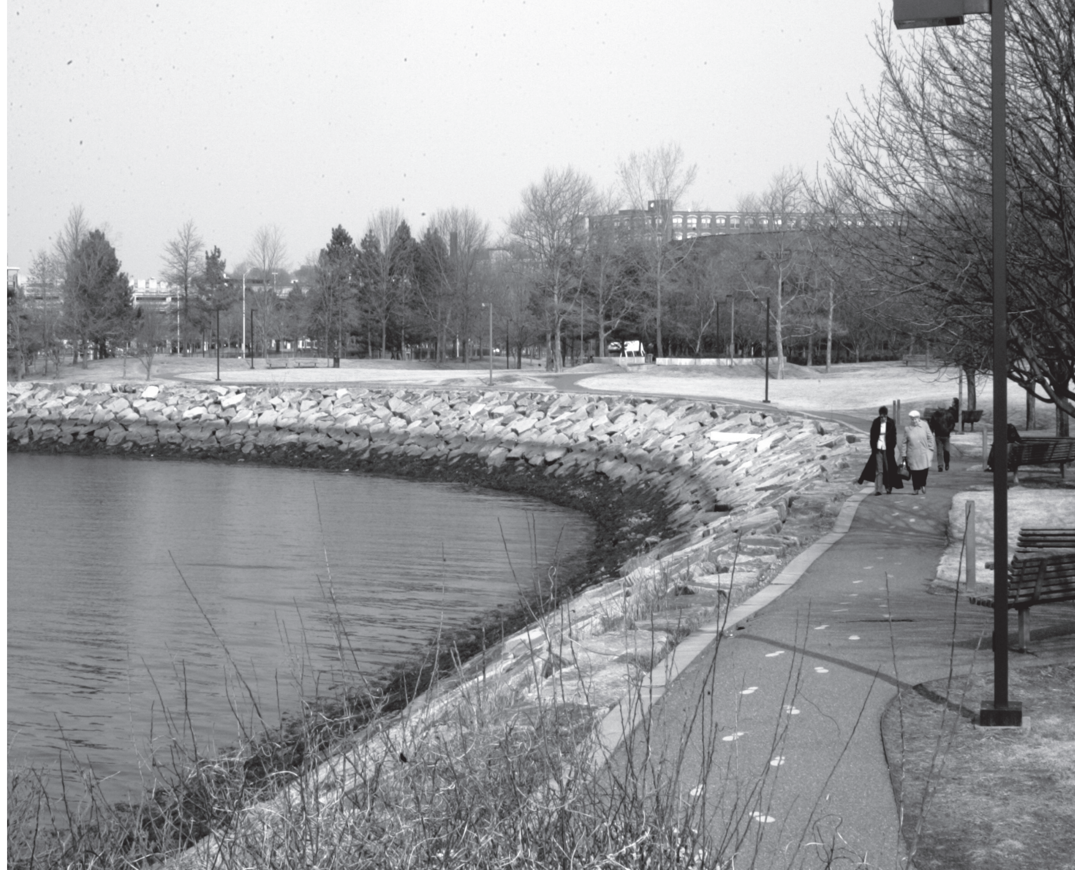
WALKWAY LEADING TO THE MARINA BEHIND SEAPORT LANDING

“This project will literally change the face of Lynn,” said Cowdell, noting that when complete, the waterfront will feature two new marinas, luxury condominiums, restaurants, green space and a venue for concerts on the harbor.